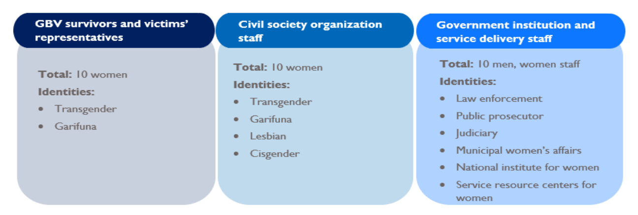
Figure 2: GBV Impunity Honduras Case Study Qualitative Interviews Sample Summary

Transgender and Garifuna survivor profiles as interview participants intersect as often both GBV survivors and representatives of civil society organizations. All transgender women interviewed in this study are GBV survivors and as part of their resilience they are leaders in formal and informal organizations dedicated to defending the rights of transgender people. Likewise, most Garifuna women interviewed in this study have been survivors of serious rights violations such as state repression, and gender and ethnicity-based threats, harassment, and forced displacement. The Garifuna women