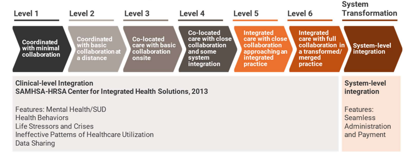
Exhibit 1. SAMHSA-HRSA Center for Integrated Health Solutions Framework

Many state Medicaid programs initially focused on improved integration of physical and behavioral health services. As mental health and substance use services have become increasingly integrated into Medicaid, policymakers became interested in broadening the scope of services offered in this integrated framework. For example, recently there has been increasing interest in including the integration of health-related social needs into this framework.<sup>xiii</sup>