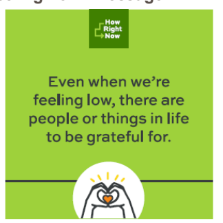
Exhibit 2. "Feeling Low" Message

NORC health communication scientists are carving a new path for the future of health campaign evaluation—one that leverages the power of multi-mode designs in order to help our clients understand the full impact of their work. If you would like to learn more about our work in this area, please contact <a href="mailto:info@norc.org">info@norc.org</a>.